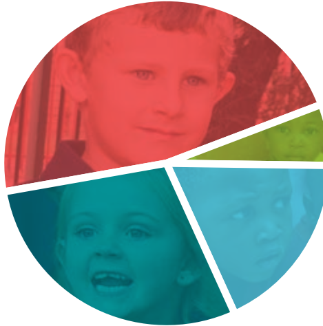
Diagram 2 Bronne van Inkomste: Gauteng, Noord Wes & Limpopo