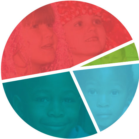
Diagram 1 Bronne van Inkomste: CMR Noord