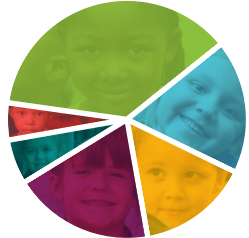
Gemiddelde besteding tydens die Beskerming van 'n Kind